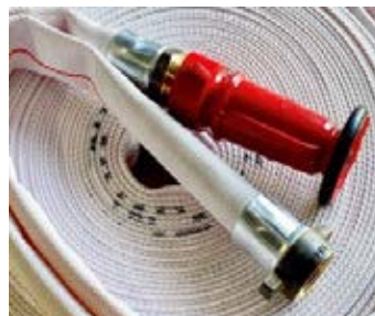
Crimped Coupling & Nozzle

All Fire Hose Kits come in standard 20m or 30m lengths with secure factory-fitted crimped BSP fittings plus shut off nozzle. The coupling connects directly to your fire pump making it ideal for quick deployment in times of an emergency during and outside fire season.