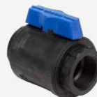
Guyco Ball Valves