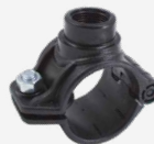
Guyco Rural Tapping Saddles