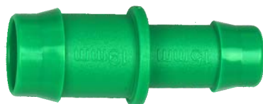
ST Reducing Joiner