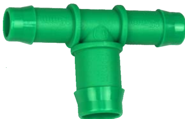
ST Increasing Tee