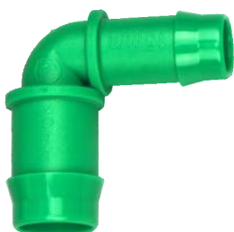
ST Reducing Elbow