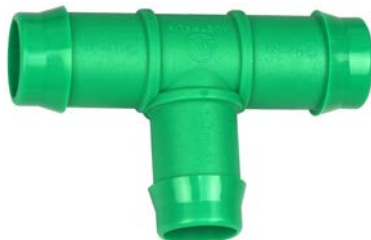
ST Reducing Tee